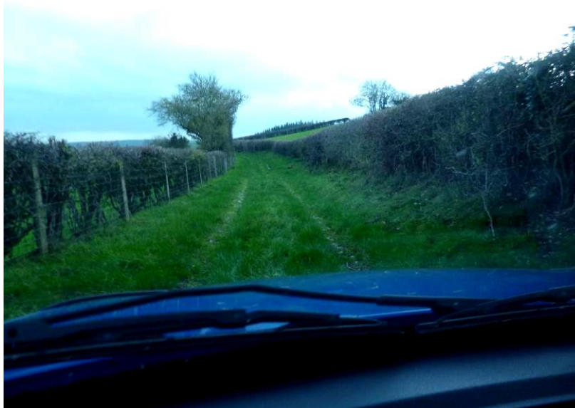
Fig.6: access to the meeting house is via a green lane through fields

The meeting house is notable for its remote location, set within farm land on the north side of the Dyffryn Meifod Efyrynwy valley and only accessible via a green lane through the fields past a farm. There is a small car park at the farm, from where Friends walk to Meeting. No other buildings are visible from the meeting house and burial ground, providing an unusually peaceful setting. The meeting house has a garden to the south, the burial ground to the east and beyond this to the east is a small wood. All these are enclosed by dry stone walls, with a rough track approach the meeting house along the south side of the wood. A path laid with small cobbles runs along the south front of the meeting house. The garden to the south of the building is lawned with shrubs and plants.