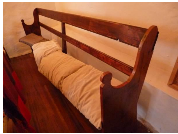
Fig.4: benches brought from other meeting houses during the late 20 th and early 21 st centuries