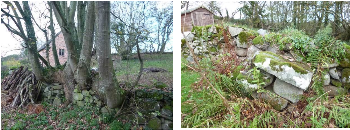
Fig.5: south wall to burial ground east of meeting house (left), and remains of mounting block against west wall (right)