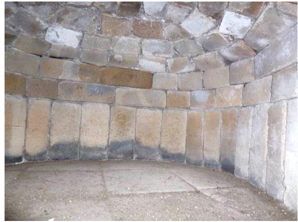
Fig.3 bread oven in cross wall between cottage and meeting room; inside the oven (right)